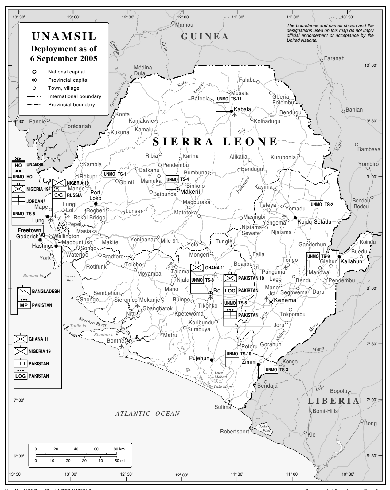
Map No. 4132 Rev. 32 UNITED NATIONS September 2005